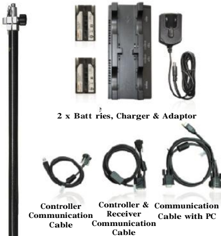
2 x Batteries, Charger & Adaptor