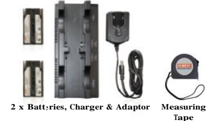
2 x Batteries, Charger & Adaptor Measuring Tape