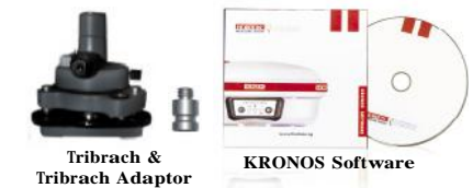
Tribach & Tribach Adaptor KRONOS Software