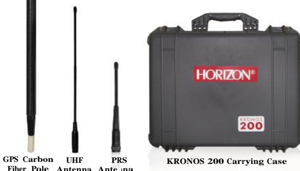
GPS Carbon Fiber Pole UHF Antenna PRS Antenna