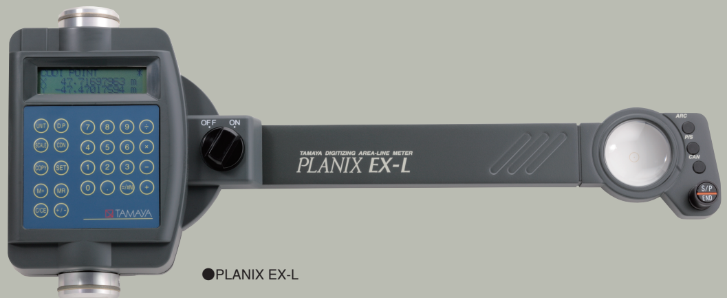
● PLANIX EX-L