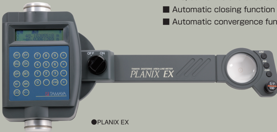
● PLANIX EX