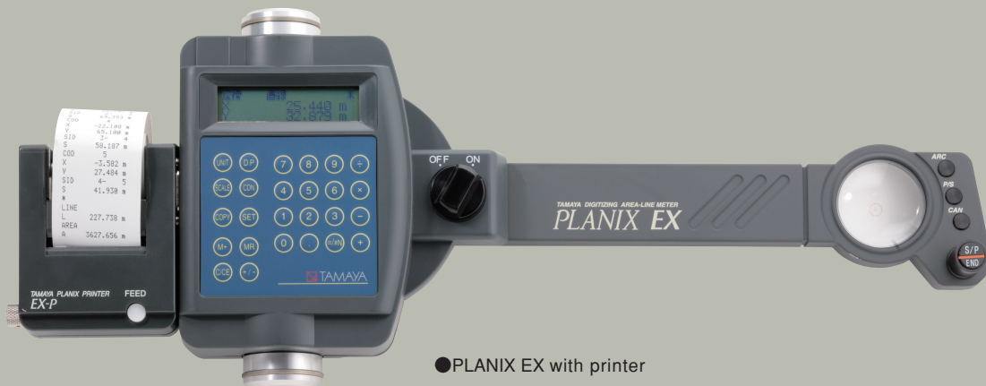
● PLANIX EX with printer